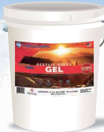
(1Gal, 2Gal, 3.5Gal, 5Gal)