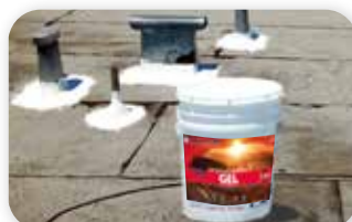
Prime, Repair & Seal