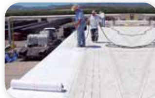
Coating or Fabric Reinforced