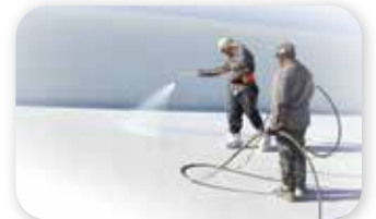
Final Coat Application