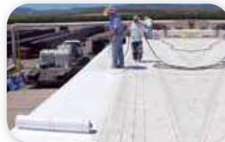
Coating or Fabric Reinforced