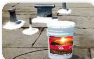
Prime, Repair & Seal