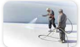
Final Coat Application